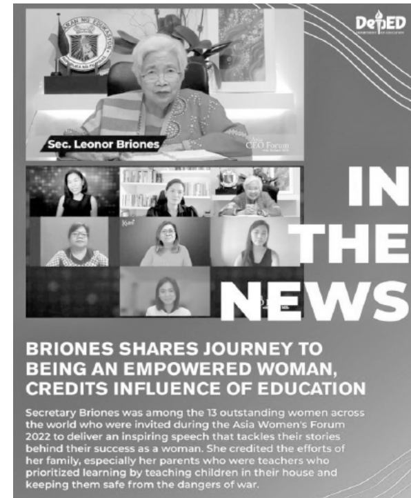
BRIONES SHARES JOURNEY TO BEING AN EMPOWERED WOMAN, CREDITS INFLUENCE OF EDUCATION

Secretary Briones was among the 13 outstanding women across the world who were invited during the Asia Women's Forum 2022 to deliver an inspiring speech that tackles their stories behind their success as a woman. She credited the efforts of her family, especially her parents who were teachers who prioritized learning by teaching children in their house and keeping them safe from the dangers of war.